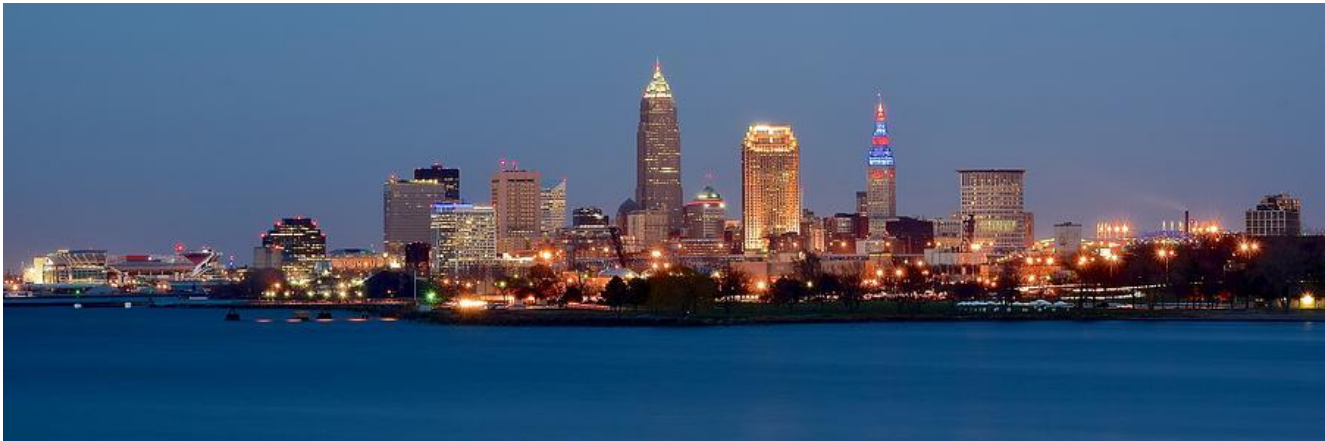
Rock & Roll Hall of Fame, Cleveland, Ohio, USA (on the banks of Lake Erie)

The Association of Inhalation Toxicologists (AIT) conference will take place on Tuesday 17 th to Thursday 19 th September 2024 at the Hyatt Regency Hotel at the Arcade in Cleveland, Ohio, USA.