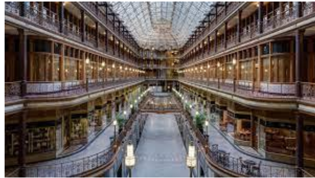
Conference hotel, Hyatt Regency Hotel at the Arcade, Cleveland, Ohio