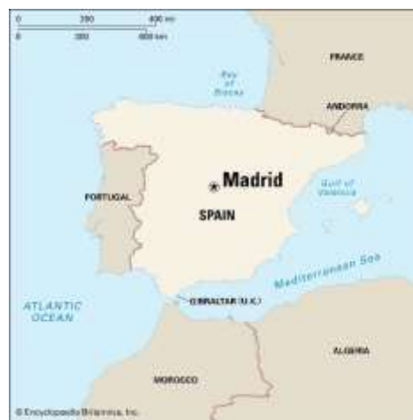
Madrid in Spain