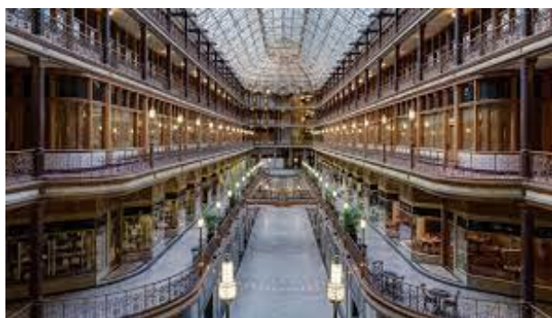
Conference hotel, Hyatt Regency Hotel at the Arcade, Cleveland, Ohio