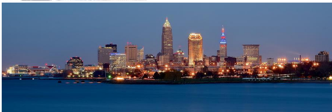
Rock & Roll Hall of Fame, Cleveland, Ohio, USA (on the banks of Lake Erie)